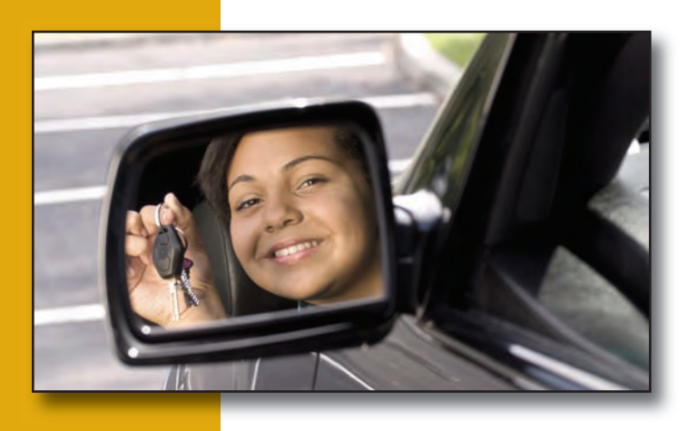
© The Auto Club Group and Minnesota Safety Council